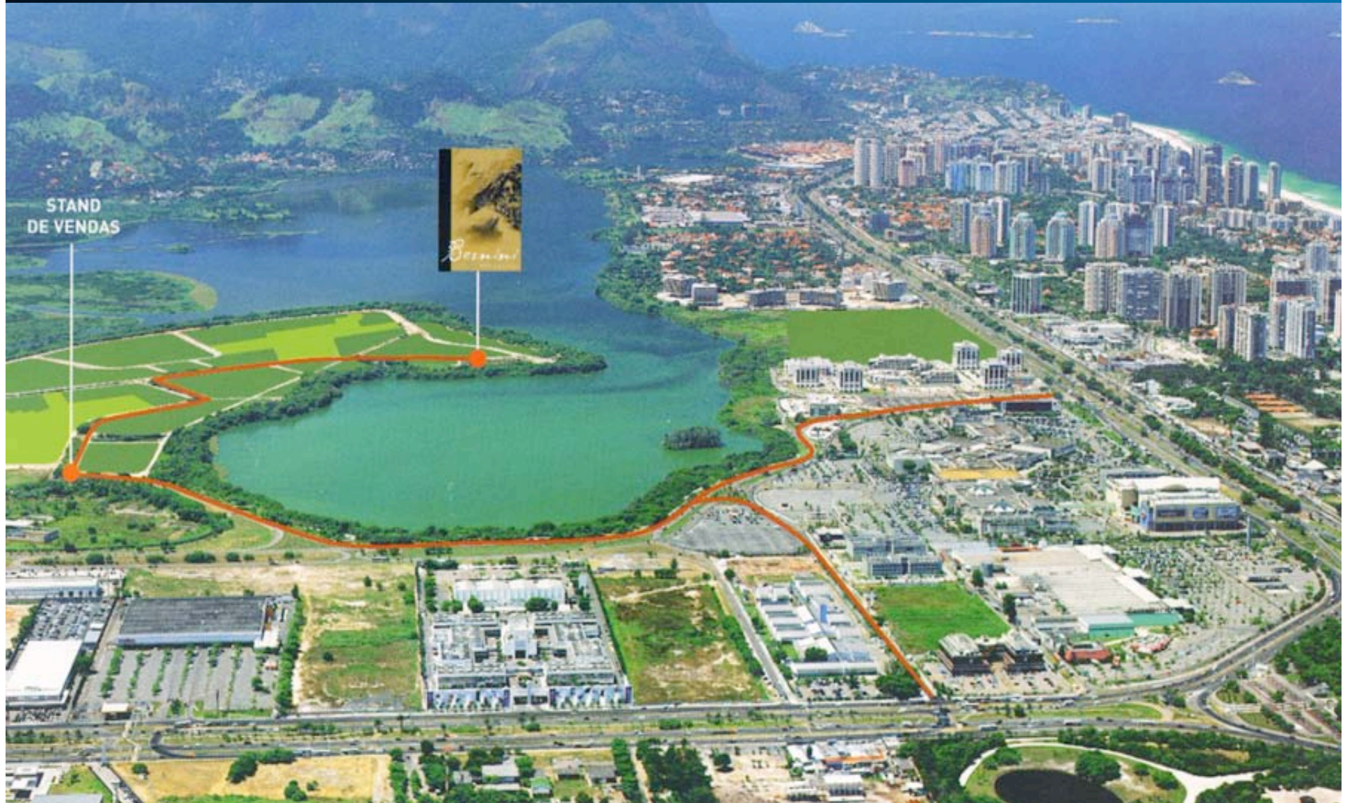
Investment proposal for luxury penthouse apartment in Rio de Janeiro